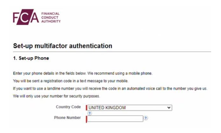
Step 6 – A 6-digit one-time passcode will be sent to your mobile or direct landline number.