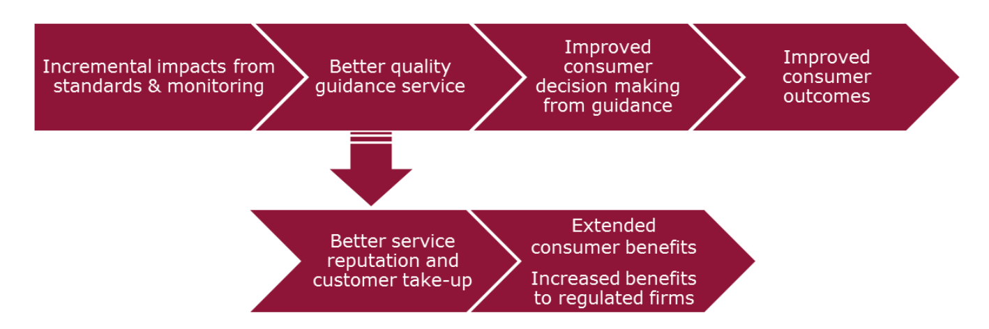
Figure 2: Benefits transmission mechanisms